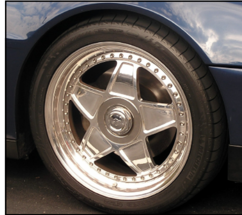
RR512-18 polished center

The wheel choice for Ferrari spline drive applications has historically been limited with some suppliers having long lead times and spotty delivery dates. Other manufacturers only offer “modern” designs that just don’t look right on Pininfarina classic body designs.