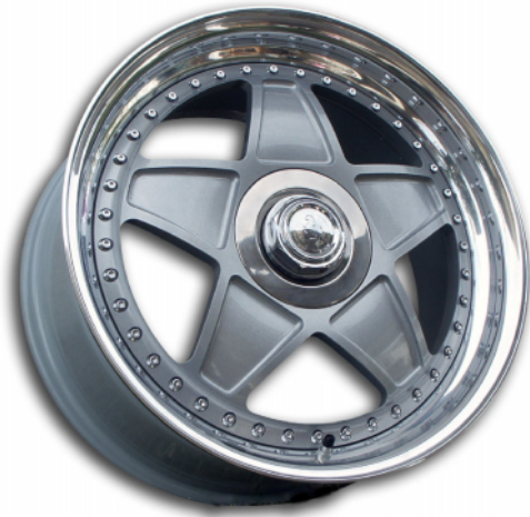
RR512-18 silver painted center